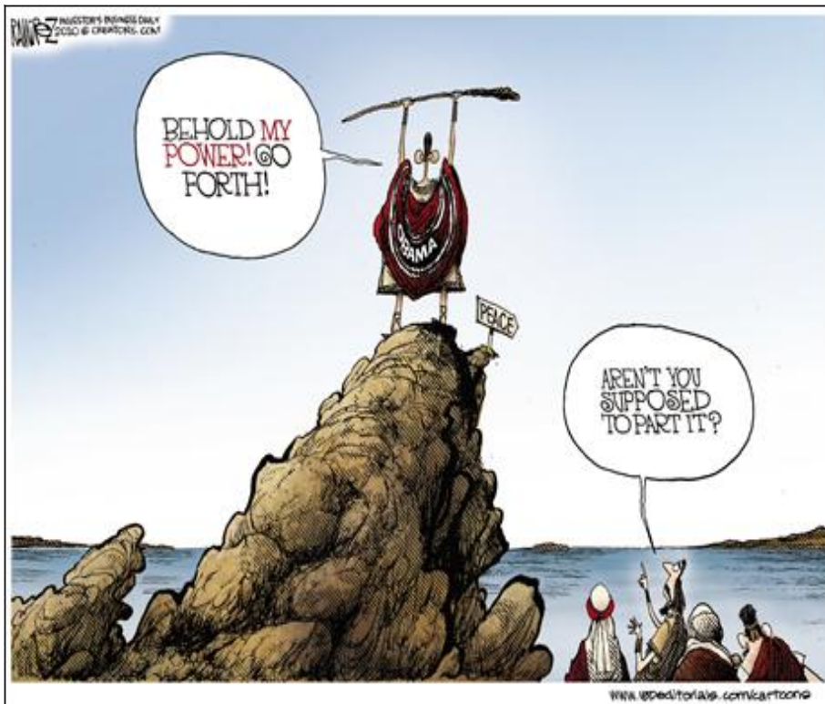
This cartoon by Michael Ramirez appeared on Townhall.com on July 9, 2010.