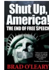
Shut Up, America! The End of Free Speech (Due out in April)